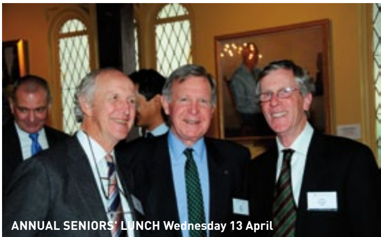
ANNUAL SENIORS' LUNCH Wednesday 13 April