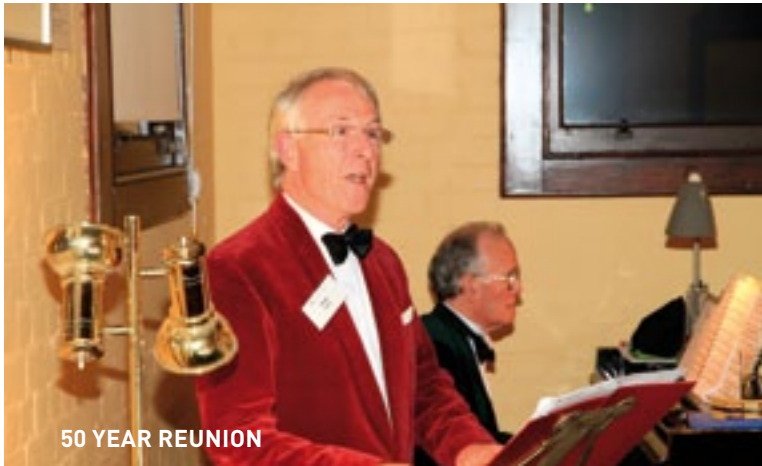
50 YEAR REUNION