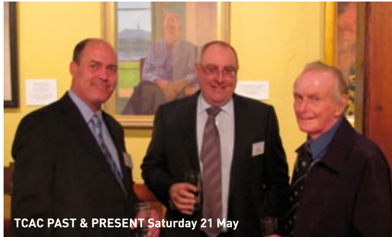
TCAC PAST & PRESENT Saturday 21 May