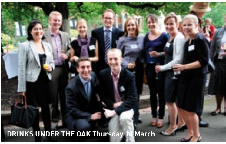
DRINKS UNDER THE OAK Thursday 10 March