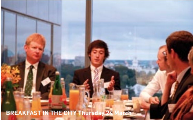
BREAKFAST IN THE CITY Thursday 24 March