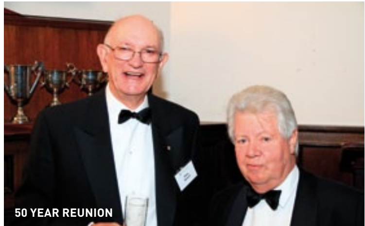
50 YEAR REUNION