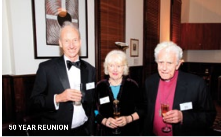
50 YEAR REUNION