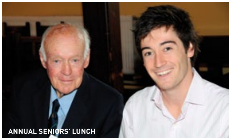
ANNUAL SENIORS' LUNCH