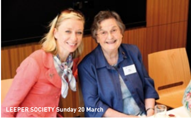
LEEPER SOCIETY Sunday 20 March