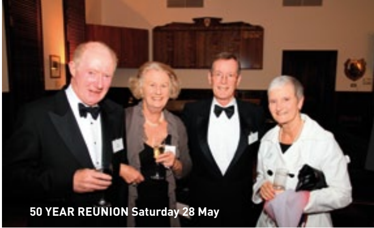
50 YEAR REUNION Saturday 28 May