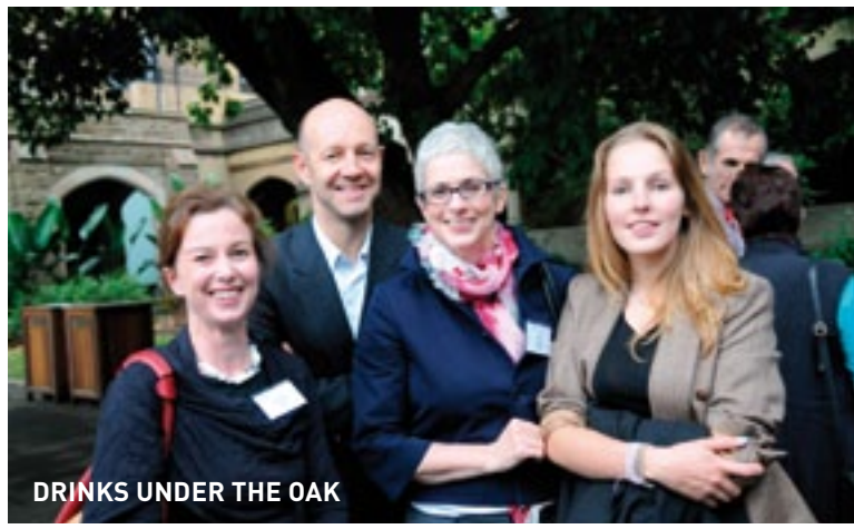
DRINKS UNDER THE OAK