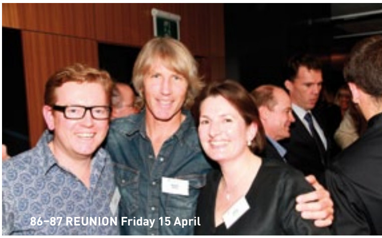
86-87 REUNION Friday 15 April